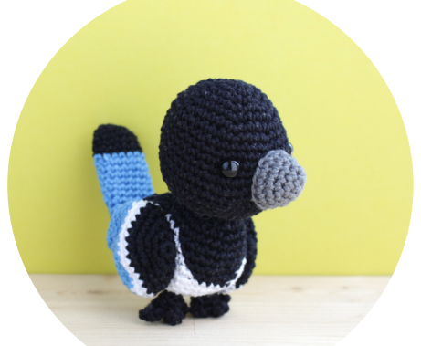
Mica The Magpie