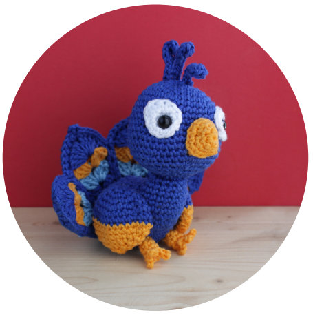
Pete The Peacock