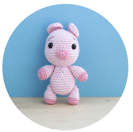
Tony The Pig