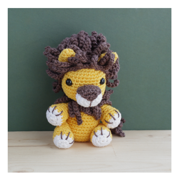
Ollie the lion