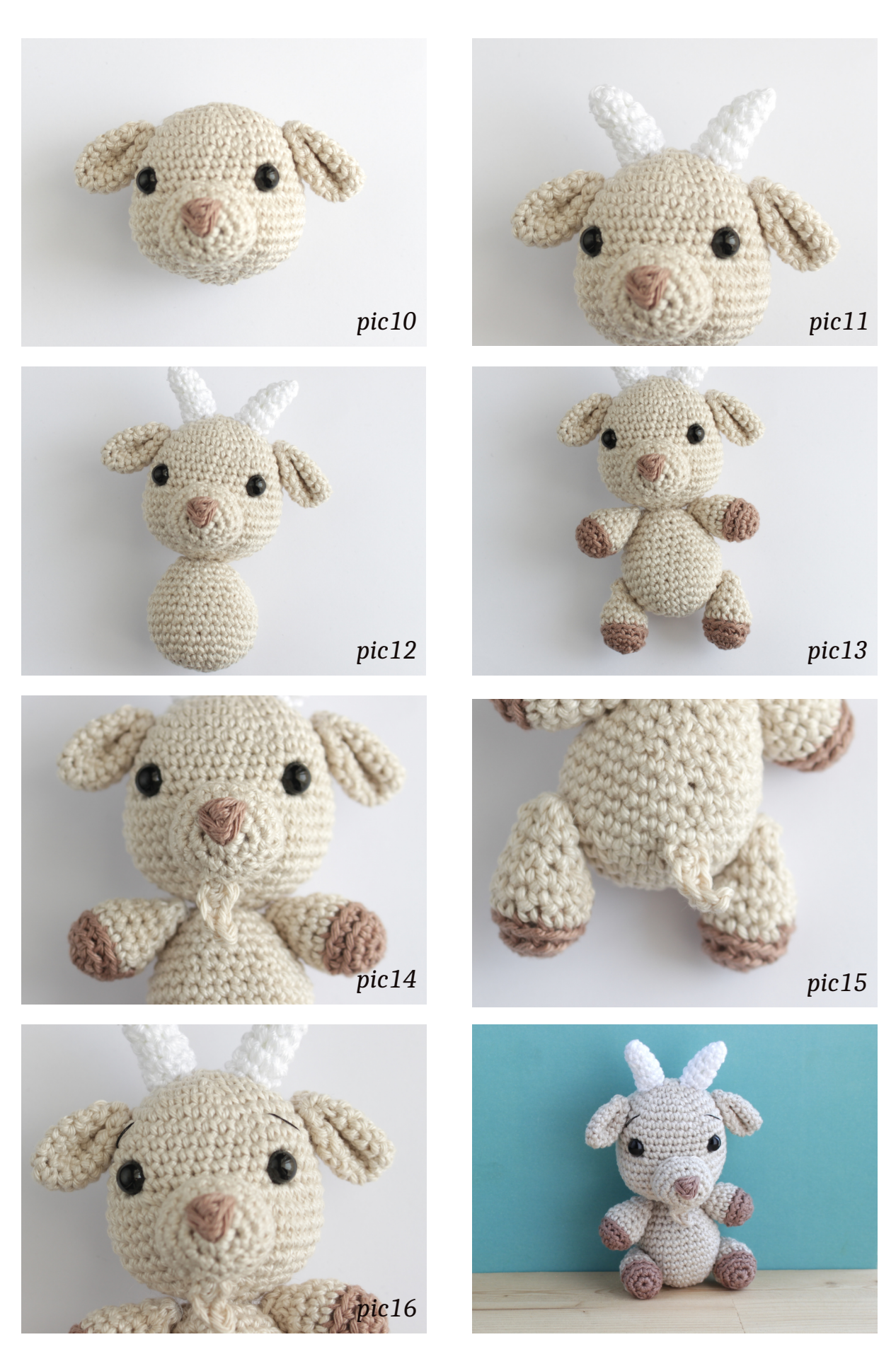
Angus the goat 9